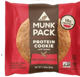
Rank 3 Projected